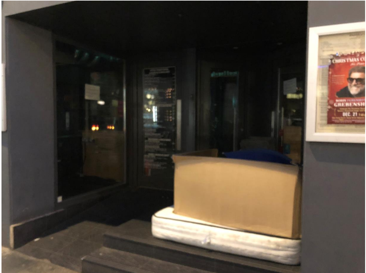
Photograph of the entrance of the premises